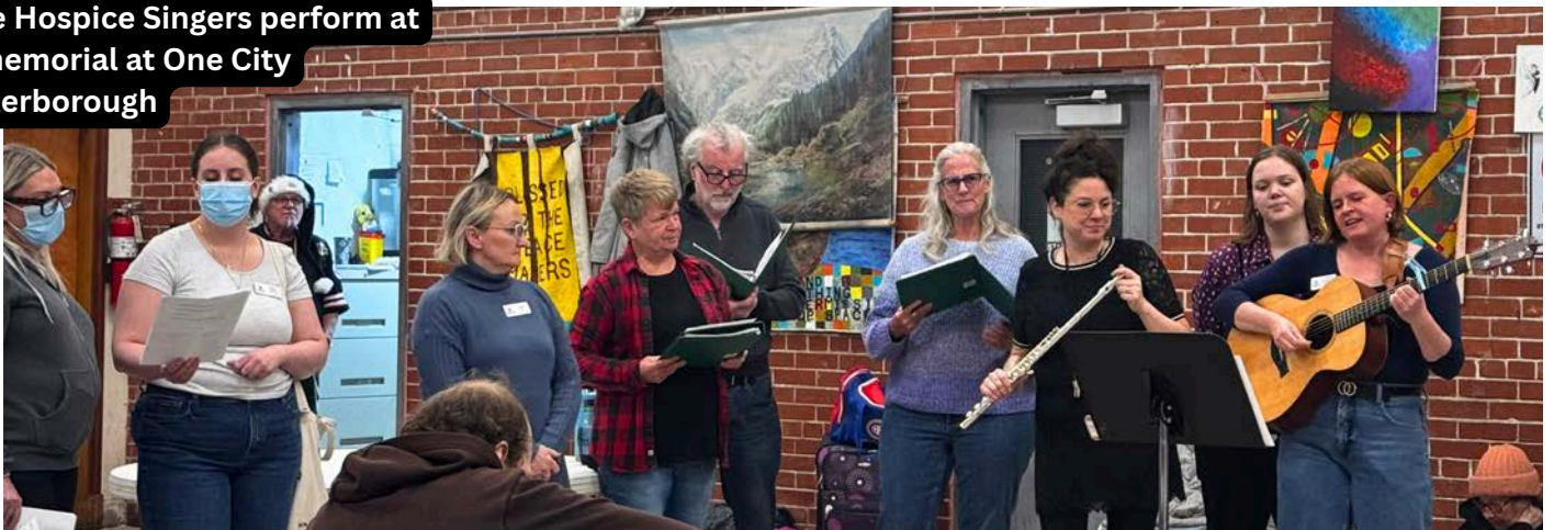
The Hospice Singers perform at a memorial at One City Peterborough