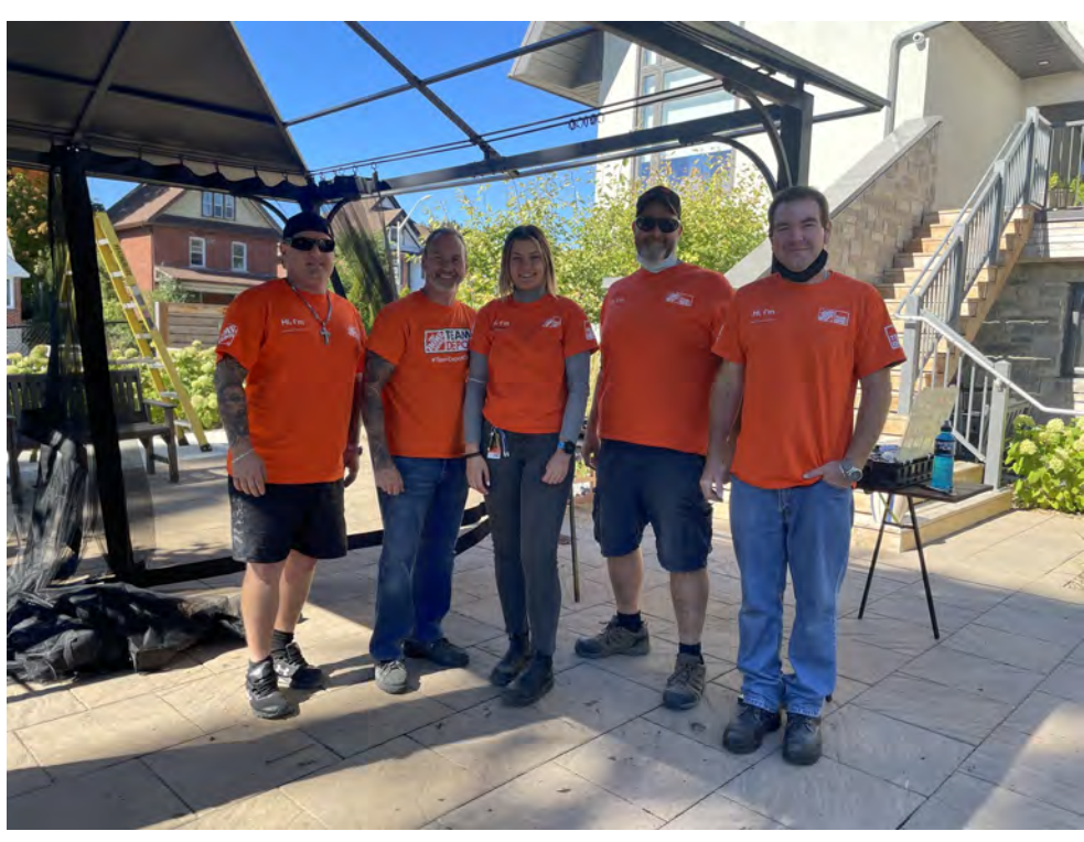
Home Depot employees provide yard work, pergola for Hospice client's comfort and enjoyment

Posting is open until November 30, 2022.