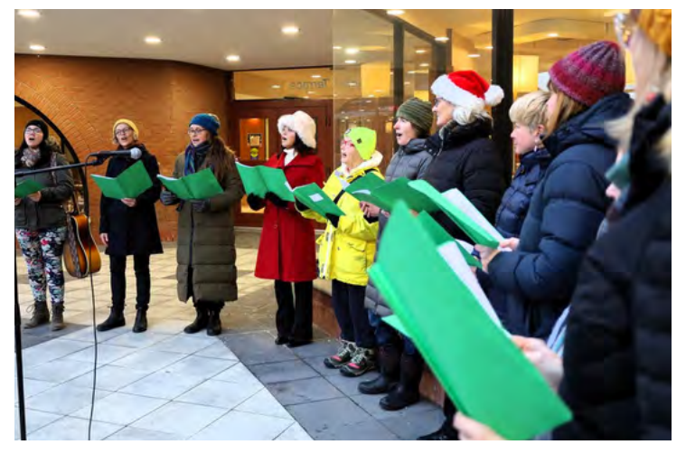
Pictured above: The Hospice Singers, a Hospice Peterborough volunteer bedside singing group, serenade the square.

how moved they were by her performance."