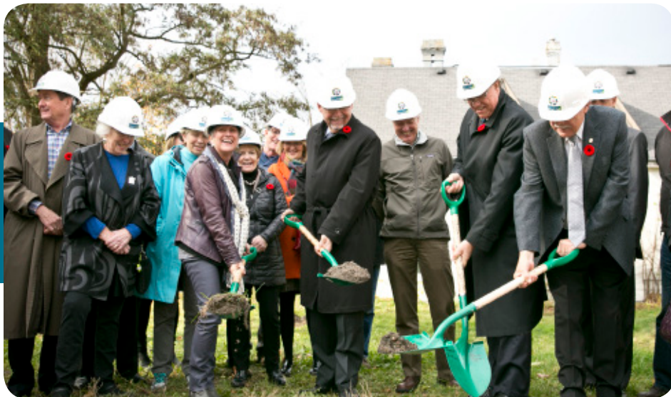
Ground Breaking November 2016

To Celebrate the opening of 325 London Street we hosted 15 days of Celebrations - Ribbon Cutting Ceremony, VIP EMM Celebration, 76 Public and Private Tours, and 2 Public Open Houses, supported by 35 Volunteers and all staff. During this time we connected with over 3,000 community guests. April 8th 2019 was also a historic day for Hospice Peterborough. This was the day we welcomed our first end-of-life resident and began providing 24/7 care. We have each had a small part in creating this legacy. Together we share this once in a lifetime accomplishment, knowing that we have made our community a better place for future generations. Thank you for your dedication and for believing we could do this. It has been a pleasure to walk beside so many inspiring people, like you.