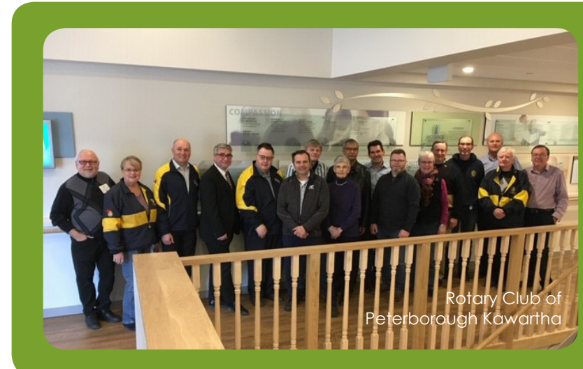
Rotary Club of Peterborough Kawartha

* EMM - indicates addition work on building project committees.