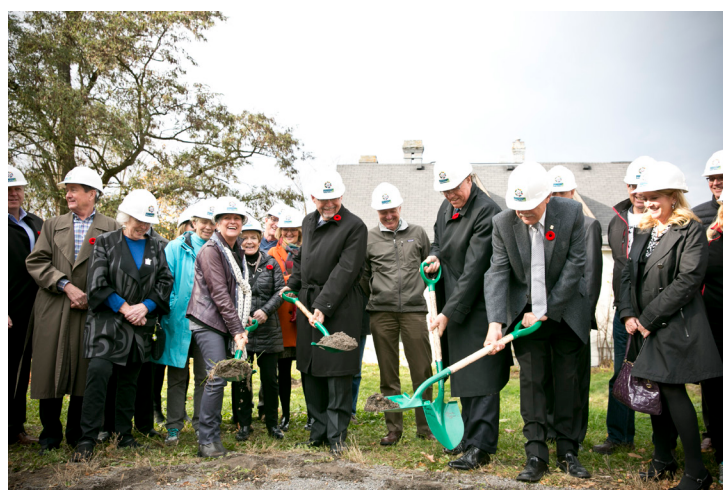
Hospice Peterborough Care Centre Ground Breaking November 1, 2016