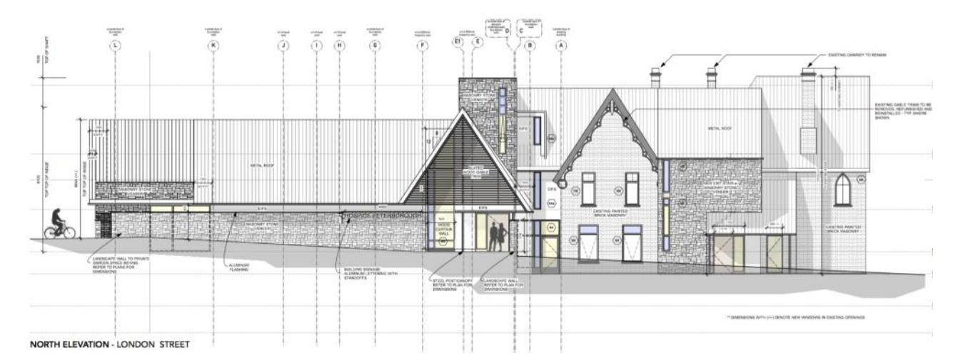
www.hospice peterborough campaign.ca